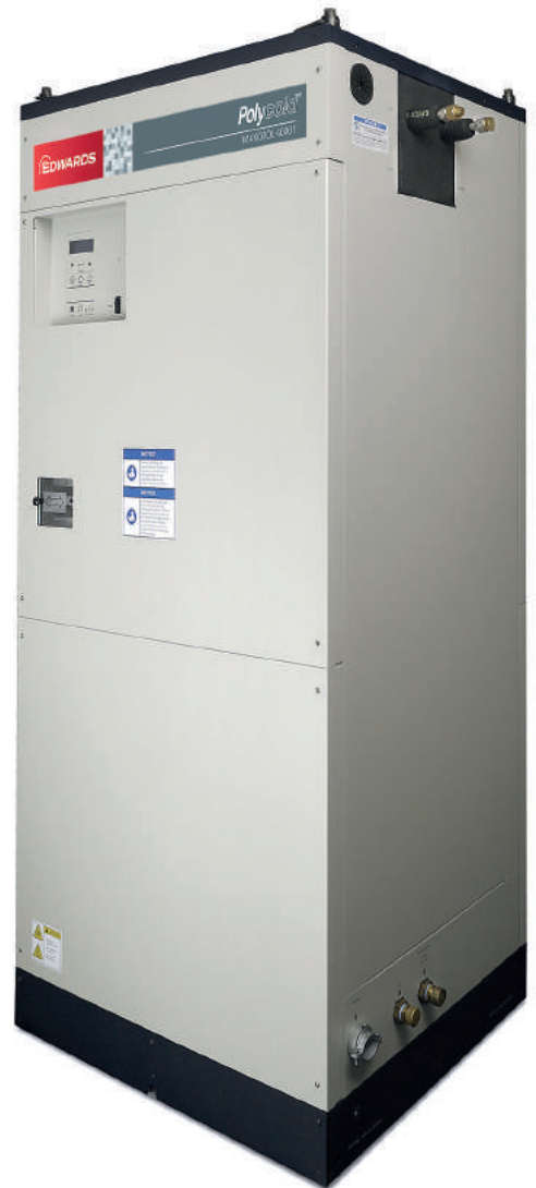
The Polycold® MaxCool 2500L Cryochiller is compliant with European Application Refrigerants (EC 1005/2009), the Montreal Protocol and the US EPA SNAP

MaxCool Cryochillers are the most cost-effective upgrade that you can add to any diffusion-pumped, turbo-pumped, or helium-cryopumped system.